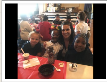
FUN AT SCHOOL