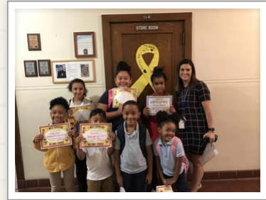
DOING WHAT I LOVE