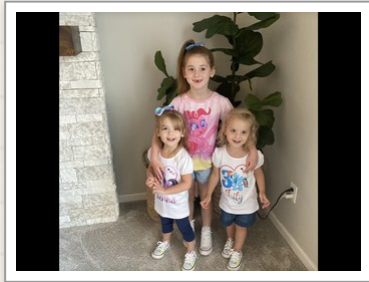
MY 3 GIRLS